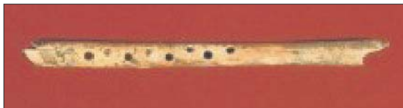
Figure 2 Bone tuner from Zhongshanzhai.

to 1.3 cm (Figure 2). A total of ten holes is organised in two parallel rows bored on one side of the pipe. The holes are so close to each other that there is no room for fingering. A pipe like this