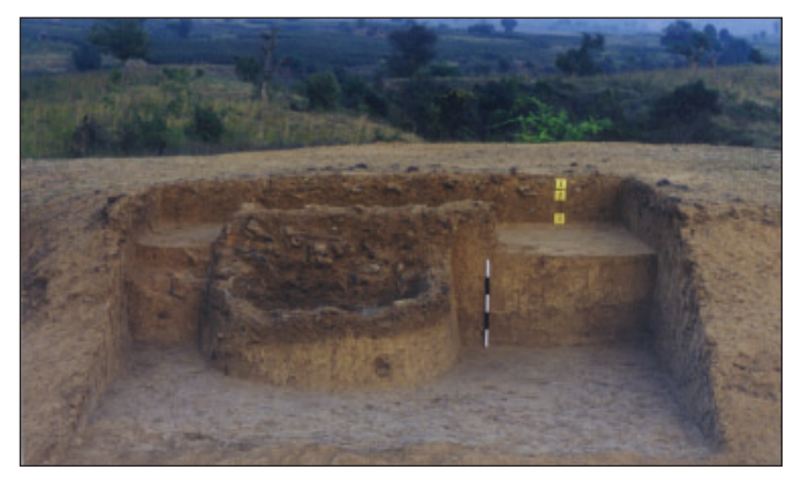
Figure 6. Damaged circular clay furnace, comprising iron slag and tuyeres and other waste materials stuck with its body, exposed at lohsanwa mound, Period II, Malhar, Dist. Chandauli.