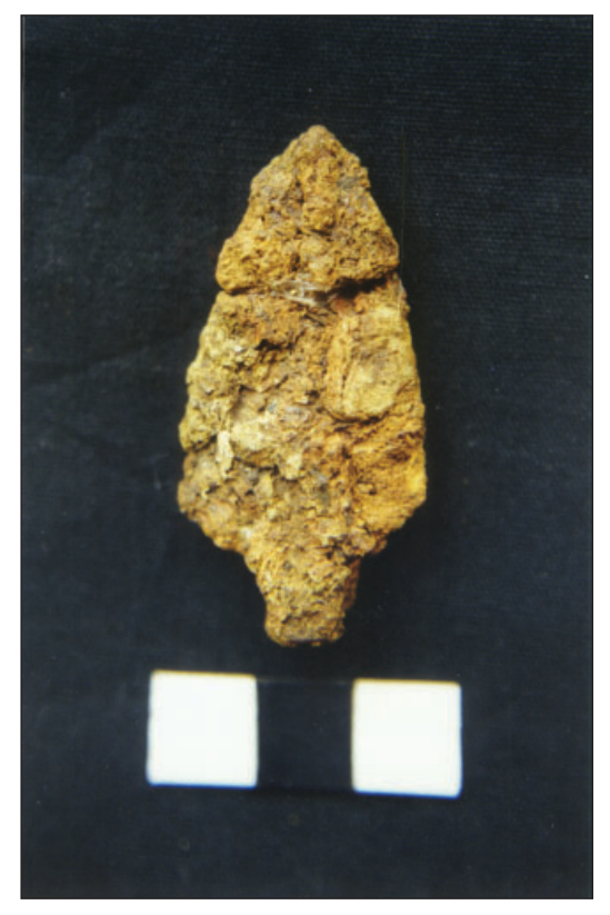
Figure 7. Highly corroded iron arrowhead, Period I, Dadupur, Dist. Lucknow.

Dadupur ( 26^{\circ} 42' N: 80^{\circ} 49' E) is in the valley of the Sai, a minor Ganga tributary near Lucknow. It is the earliest dated site (Tewari et al. 2002:111) between the Gomati and the Sai rivers. The excavations at this site have revealed a sequence divided into