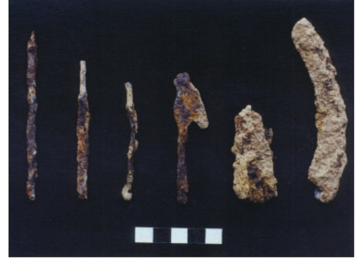
Figure 4. Iron artefacts, from the lower and middle levels of Period II, Malhar, Dist. Chandauli.

The area around Malhar may have been something of a centre of iron production. A small mound, of a kind known locally as lohsan or lohsanwa , about 500m south