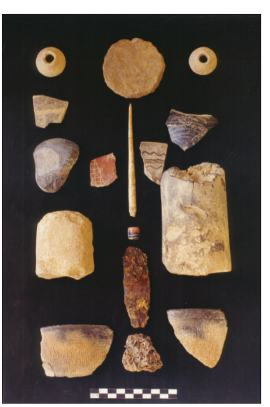
Figure 5. Important cultural components of the early iron bearing deposits, showing corded ware sherds, iron artefact, slag, tuyere, stone and bone artefacts, painted and incised potsherds, stone and terracotta beads. Period II, Malhar, Dist. Chandauli.

to the main site of Malhar, which looks like a heap of iron slag, on excavation revealed two damaged clay furnaces, one of them is illustrated here as Figure 6, filled with iron slag along with a few sherds of the red, grey, and black slipped wares, an axe, and tuyeres. Survey revealed several lohsanwa sites near Musakhand village, the site known as Phakkada Baba located within the Musakhand dam, to the north-west of Malhar, on Baba Wali Pahari (Tewari et al. 2000) and near Naugarh kot (Singh et al. 2000: 143). Plans of damaged clay furnaces within heaps of iron slag along with tuyeres stuck with smelted iron, and potsherds of the grey, black slipped, NBP and red wares were found at these sites. The pottery assemblage at Phakkada Baba also included examples of dish or bowl-on-stand and other forms, comparable to those from Malhar Period II, in red ware, and black-and-red ware. This extraordinary concentration of iron-slag heaps on Baba Wali Pahari and Naugarh kot suggest that large-scale iron smelting activities continued at these sites for a long time.