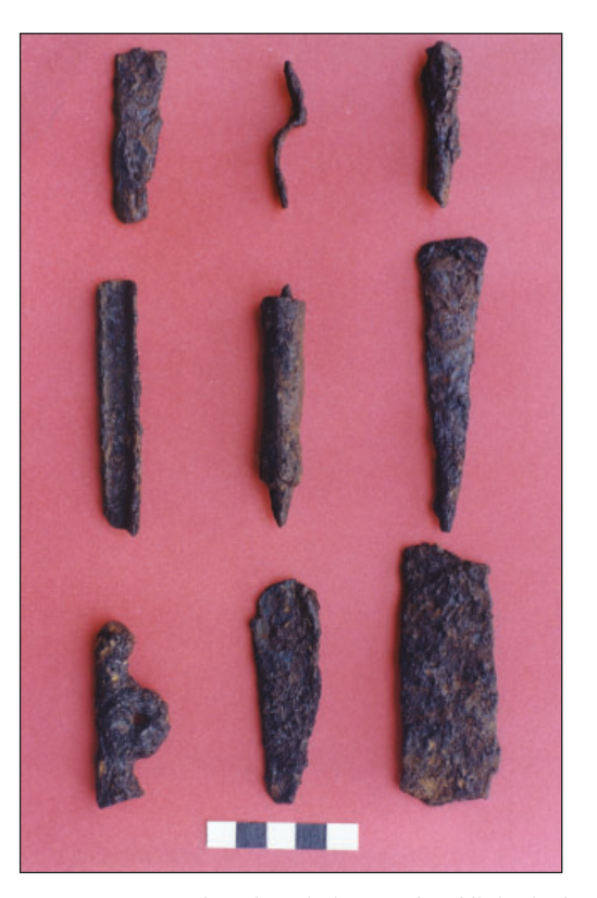
Figure 3. Iron artefacts, from the lower and middle levels of Period II, Raja Nala-ka-tila, Dist. Sonbhadra.

Since the date for the introduction of iron in the middle and lower Ganga Valley was