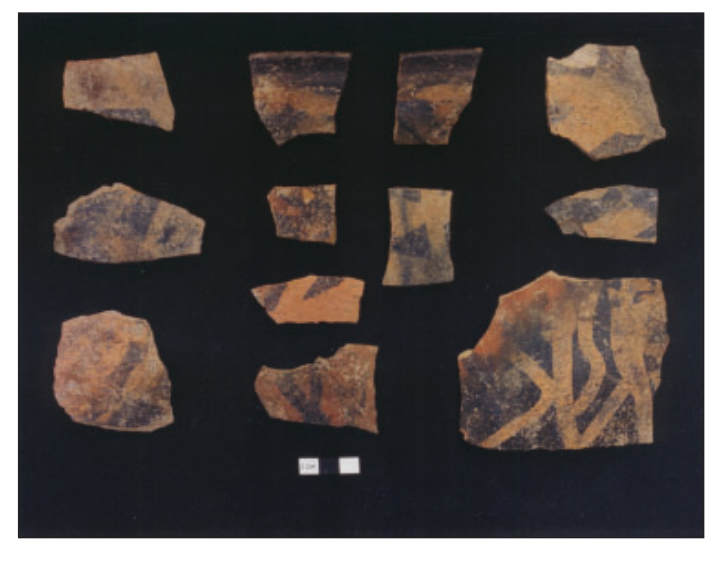
Figure 2. Painted black-and-red ware sherds, from early iron bearing deposits of Period II, Raja Nala-ka-tila, Dist. Sonbhadra.

Plain and the adjacent part of the Vindhvas. This has further implications in defining the beginning of iron in the subcontinent as a whole. The excavated sites are Raja Nala-ka-tila (1996-98), Malhar (1998-99), Dadupur (1999-2001) and Lahuradewa or Lohradewa (2001-2002) (Figure 1) Raja Nala-ka-tila (Lat. 24° 41' 55" N.; Log. 83° 19' E.) is located in the upper reaches of the Karamnasa within its loop like meander in district Sonbhadra. The excavations revealed a sequence which