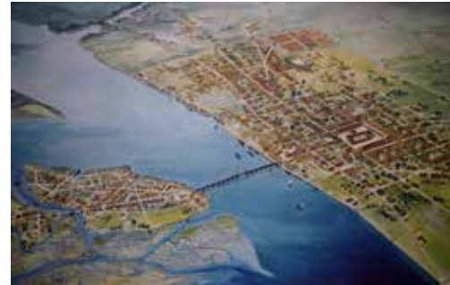
Reconstruction drawing of Londinium in 120 AD, Museum of London

Walk through Londinium from the south-east corner of the City on the riverside through to the banks of the Walbrook and then to the northwestern corner near the late first century fort in one morning. More information & booking available on our website: tag2019ucl.sched.com.